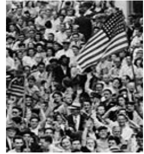
People everywhere celebrated "America's Greatest Day" on August 11, 1945

By remembering and reflecting upon the achievements of the generation that endured the difficult times of the Great Depression, defended freedom in WWII, and then went on to assure a better future for their children and their children's children, Americans of all ages can come together to renew our national spirit so that we can meet the historic challenges of our own time. It is especially important that the youth of America be involved in Spirit of '45 Day in ways that help inspire them to contribute to making the world a better place in their lifetime.