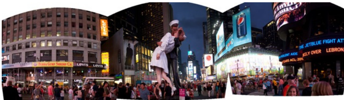
On the inaugural Spirit of '45 Day in 2010, thousands of people gathered around a giant Seward Johnson sculpture of the famous "kiss" seen around the world on August 14, 1945 that was brought in to New York's Times Square.