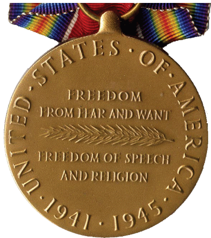
WWII VICTORY MEDAL

“Today, we face our own challenges -- some new, some all-too familiar. By remembering the World War II generation, we can learn from their example, and be inspired by their spirit -- the Spirit of '45.”