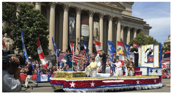
2015 Memorial Day Parade Wash. D.C.