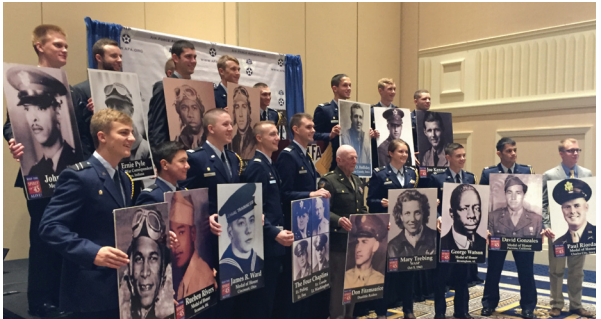
Arnold Air Society/Silver Wings helping to keep the Spirit of '45 alive on America's university and college campuses